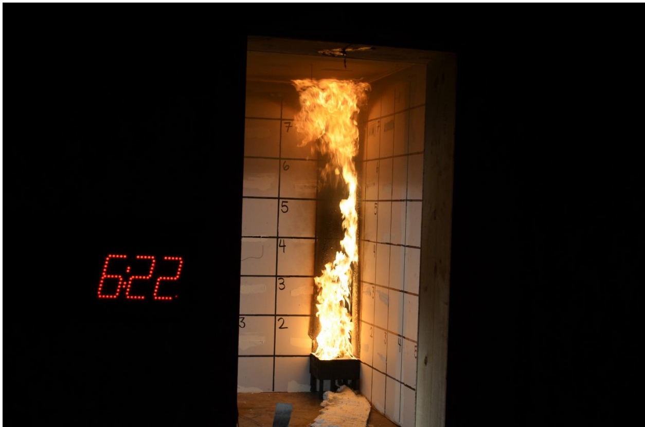
NFPA 286 Fire Test Flame, at 160 kW

When foam plastic insulation materials are used in US buildings, they not only must meet the fire test requirements indicated above; they must also be separated from the interior of the building (or the habitable areas) by a thermal barrier or the foam plastic must meet requirements based on a full-scale room corner test, typically NFPA 286 5 . The figure below shows flames in the NFPA 286 fire test. That test assesses whether the material causes sufficiently low heat release, smoke release and flame spread and whether it is likely that flashover will occur. Typically, the requirements will not be met by common foam plastic materials, which is why the thermal barriers ensure fire safety.